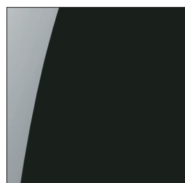
Black High Gloss