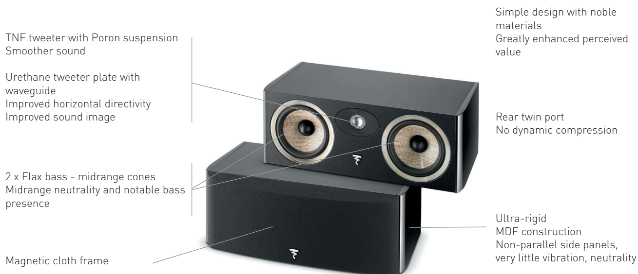
Aria CC 900 Black High Gloss

The Aria CC 900 2-way center speaker can be easily combined with the front speakers of the range. The CC 900 was developed with particular attention to timber matching in order to obtain sonic coherence and homogeneity for all kinds of configurations. Recommended for rooms measuring from 215ft 2 (20m 2 ) and for a listening distance of 10ft (3m).